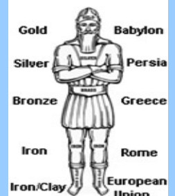
- Image of Daniel 2 -

Note: The expansion of the European Union to include 10 new nations on May 1, 2004, marks our generation as the last to dwell upon this earth for 1000 years. A prophetic dream was given by God 2500 years ago, detailing the progression of earthly governments, beginning with kingdom of Babylon and ending at the time of the Enlargement of the European Union. (The ten toes) "And in the days of these kings shall the God of heaven set up a kingdom, which shall never be destroyed: and the kingdom shall not be left to other people" (Daniel 2:44). Shortly after Europe unites, God's Everlasting Kingdom will arise and shall display its sovereignty over earthly governments, sweeping them away forever. "The iron, the clay, the brass, the silver, and the gold... became like the chaff of the summer threshing floors; and the wind carried them away, that no place was found for them" (Daniel 2:35). This catastrophic process is biblically known as "The desolation of the earth".